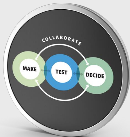
Figure 3: Make-Test-Decide innovation cycle used in product R&D.